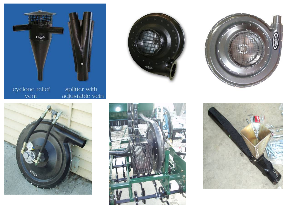
Smallaire components including venturii( lower right) – note slim line of blower on plot machine – centre top blower has 150 mm outlet while the others have 75 mm outlets