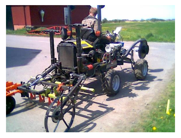
Plate 3. MacTrac (<u>www.mactrac.se</u>) use of Flexiseeder - Smallaire module on its new prototype modular plot seeder, under construction.

Good progress made in Norway during 2007 for up-grading their air delivery system prompted Sweden to adopt the same system for its MacTrac project. The object of the Swedish project is to make a drill module for the MacTrac tool carrier. It is a co-project between the Applied Field Research group at the Swedish University af Agricultural Sciences (SLU), Mapro Systems AB (producer of MacTrac) and the Agricultural Soceity of Halland (user of the drill). The main part of the component costs are paid by the end user while SLU and Mapro have taken development costs. Besides the Flexiseeder – Smallaire module, portion feeder, digital drive, and tool bar / tyne / tip modules are being used from the New