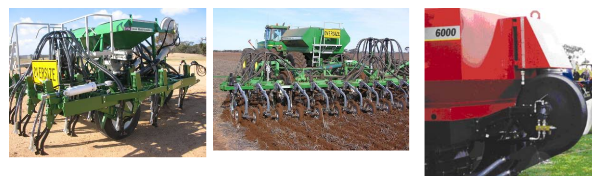
Three examples of larger machines fitted with Smallaire technologies which overlap with the Flexiseeder modules. Note the hydraulic drive on fans. The two machines on the left, built by Smale (<u>www.smale.com.au</u>) in Australia are fitted with 22 series blowers and the Horwood Bagshaw (<u>www.horwoodbagshaw.com.au</u>) machine on right is fitted with a 19 series blower.Both have 150 mm blower outlets.