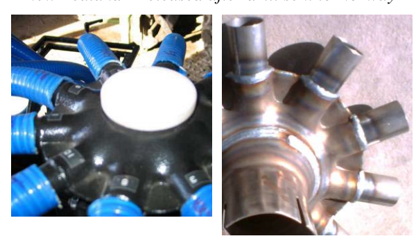
Norway Flexi-Plot Machine – modified distributer insert (Norway Cone), manometer