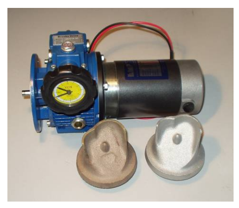
Plate 5. Flexiseeder Brooks-S&N mechanical vari-speed module including two impellor blocks, one cast in bronze and the other aluminium.

Recommended operating speeds for impellors of this type vary between; 600 rpm for big beans, 750 rpm for soya and peas and 900 rpm for grain, oilseeds, etc. Fertilizer requires at least 900 rpm. Therefore ranges of working speeds are required between 500 and 1500 rpm or at some fixed speeds 600/750/900/1050/1200. These impellor speeds cannot be obtained using the above modification. The project is therefore working with John Brooks Ltd to develop and promote an alternative 12 / 24 volt drive of 180 / 250 watt and 1500 and 2000 rpm capacity coupled with an in-line mechanical variator (see Fraser et.al. 2008 and Plate 5).